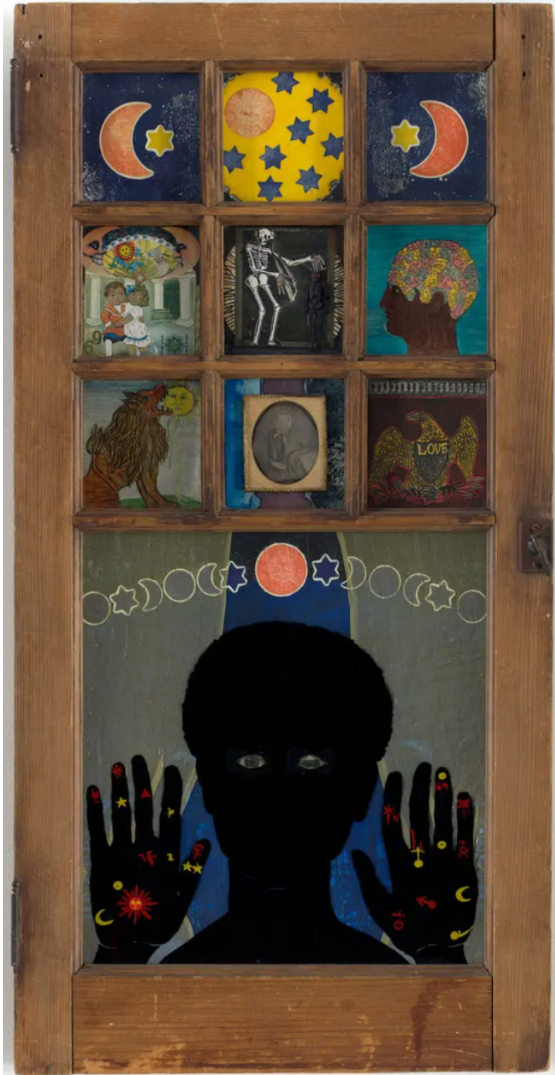
Betye Saar Black Girl's Window, 1969