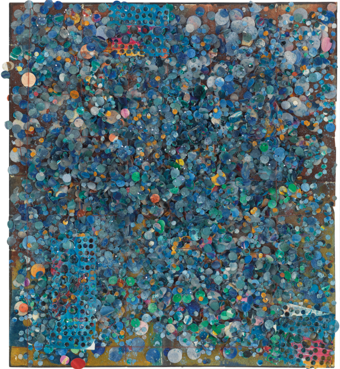
Howardena Pindell Untitled #98, 1978 Mixed media on board 10 x 9 inches