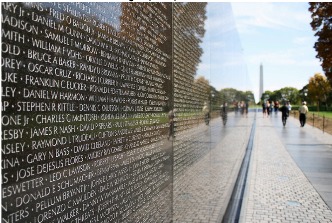
Honoring over 58,000 Lives