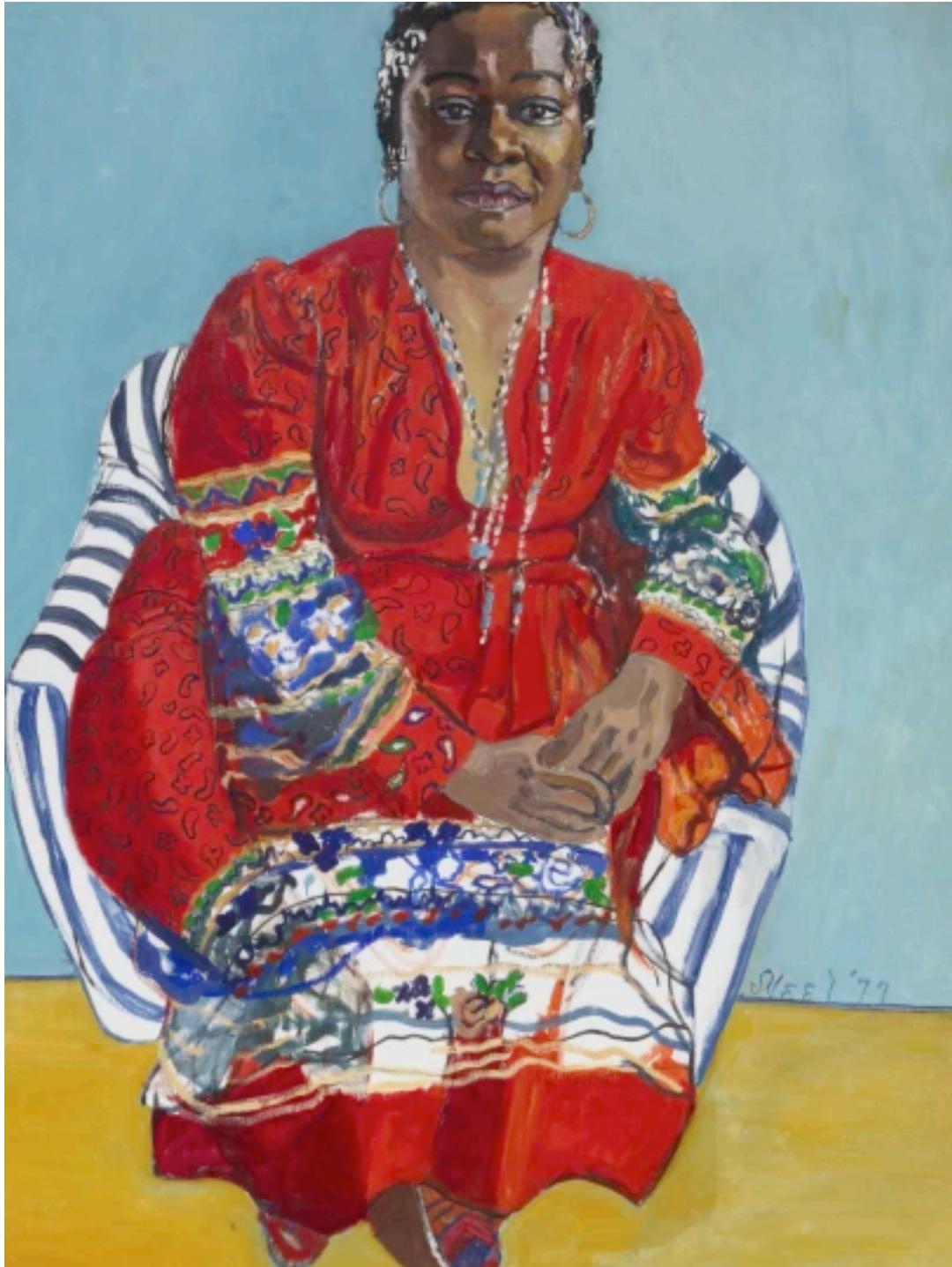
Alice Neel Faith Ringgold, 1977 Oil on Canvas 48 x 36 inches © The Estate of Alice Neel