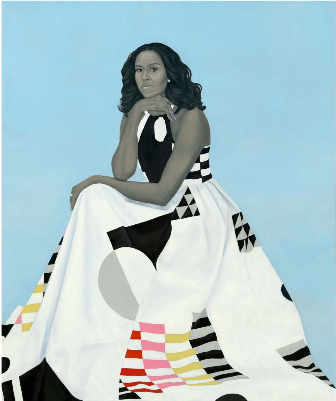
Amy Sherald Michelle LaVaughn Robinson Obama, 2018 75 13/16 × 63 13/16 inches Oil on linen