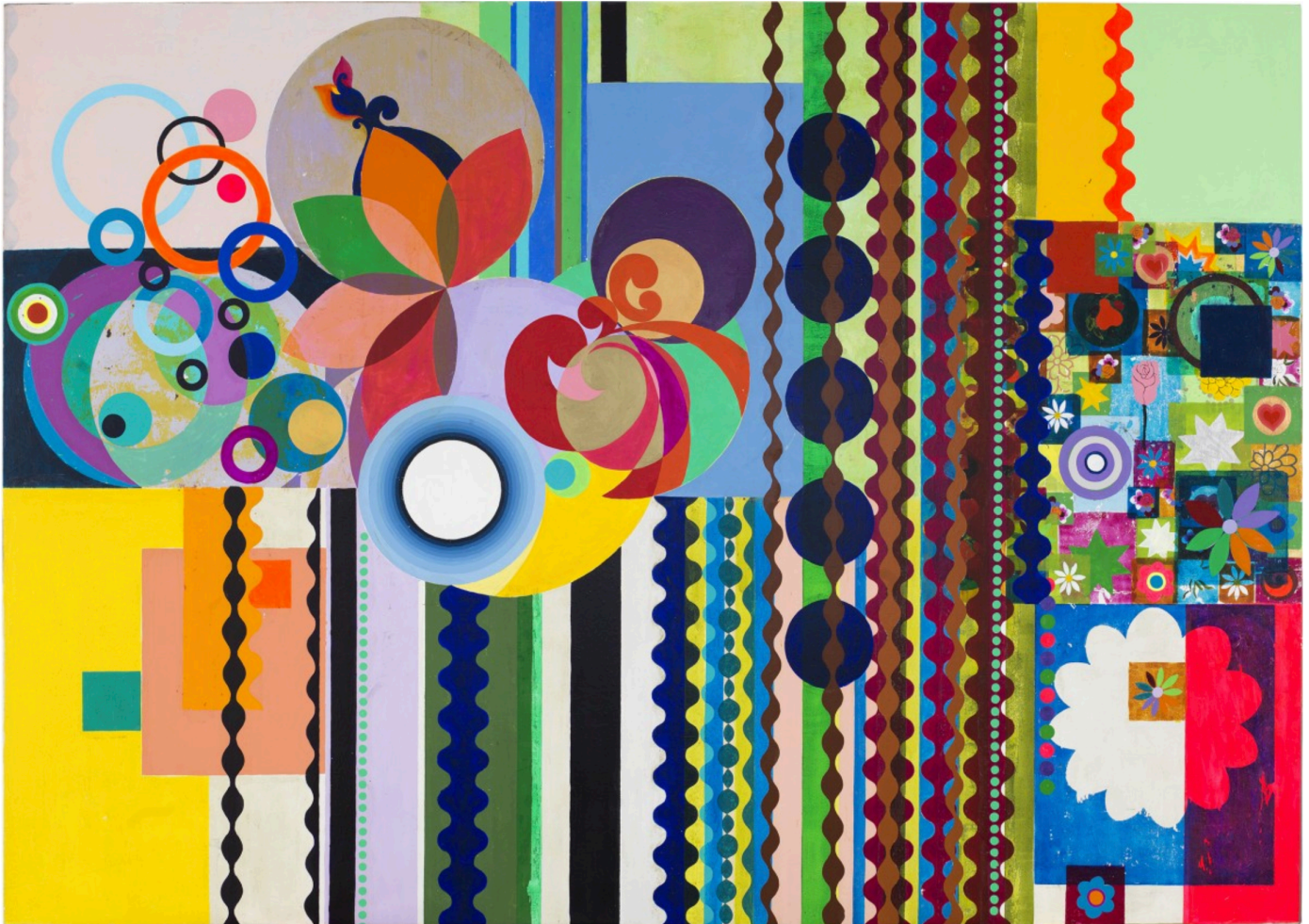
Beatriz Milhazes Dancing 2007 Acrylic paint on canvas 97 1/4 × 137 13/16 in