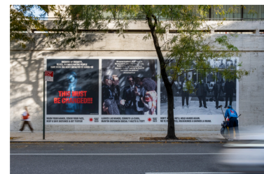
Nationwide Public Artworks created by Carrie Mae Weems for RESIST COVID/TAKE 6!