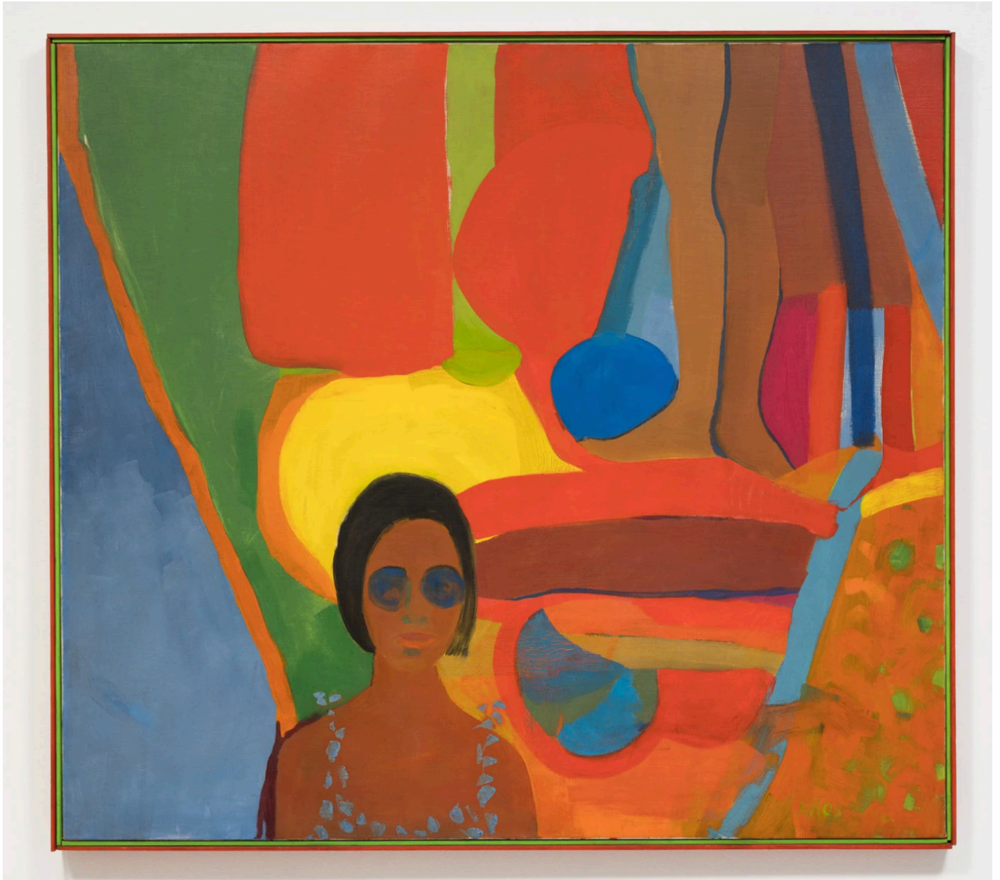
Emma Amos Baby, 1966 Oil on Canvas 46 1/2 x 51 in