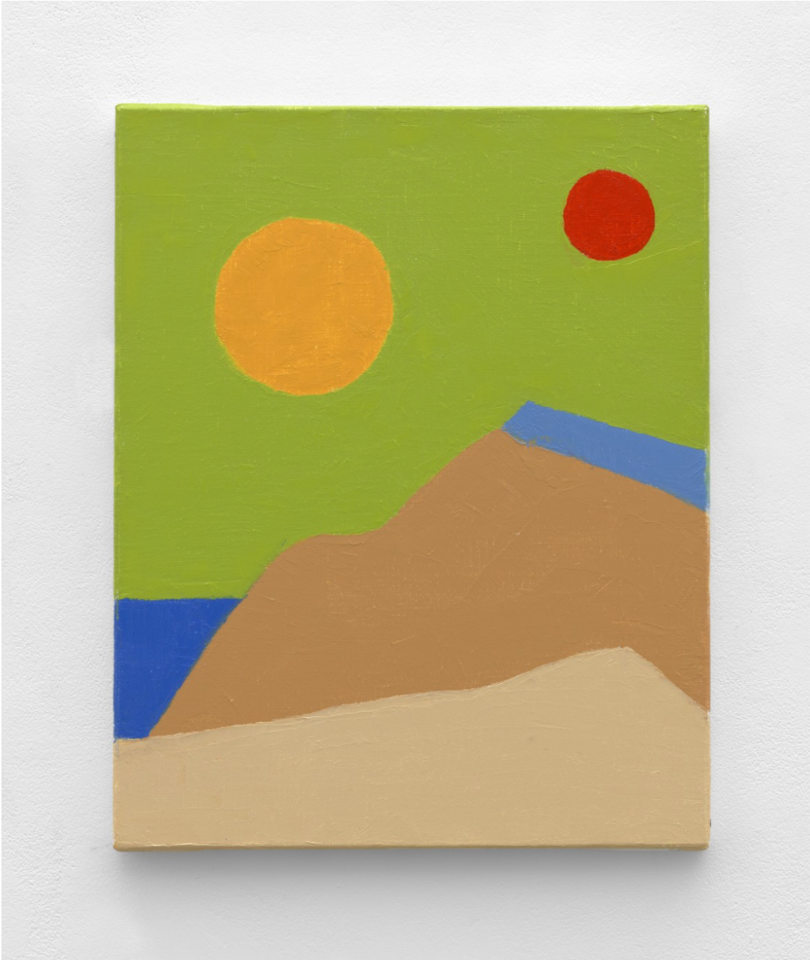
Etel Adnan Untitled 2016, Oil on Canvas 16 1/8 x 13 inches (41 x 33 com)