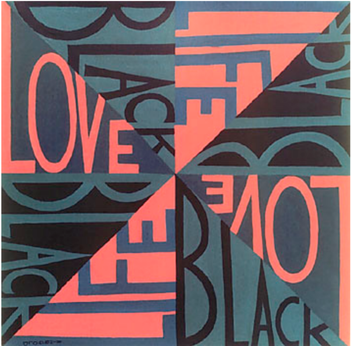
Faith Ringgold Black Light Series #6: Love Black Life, 1969