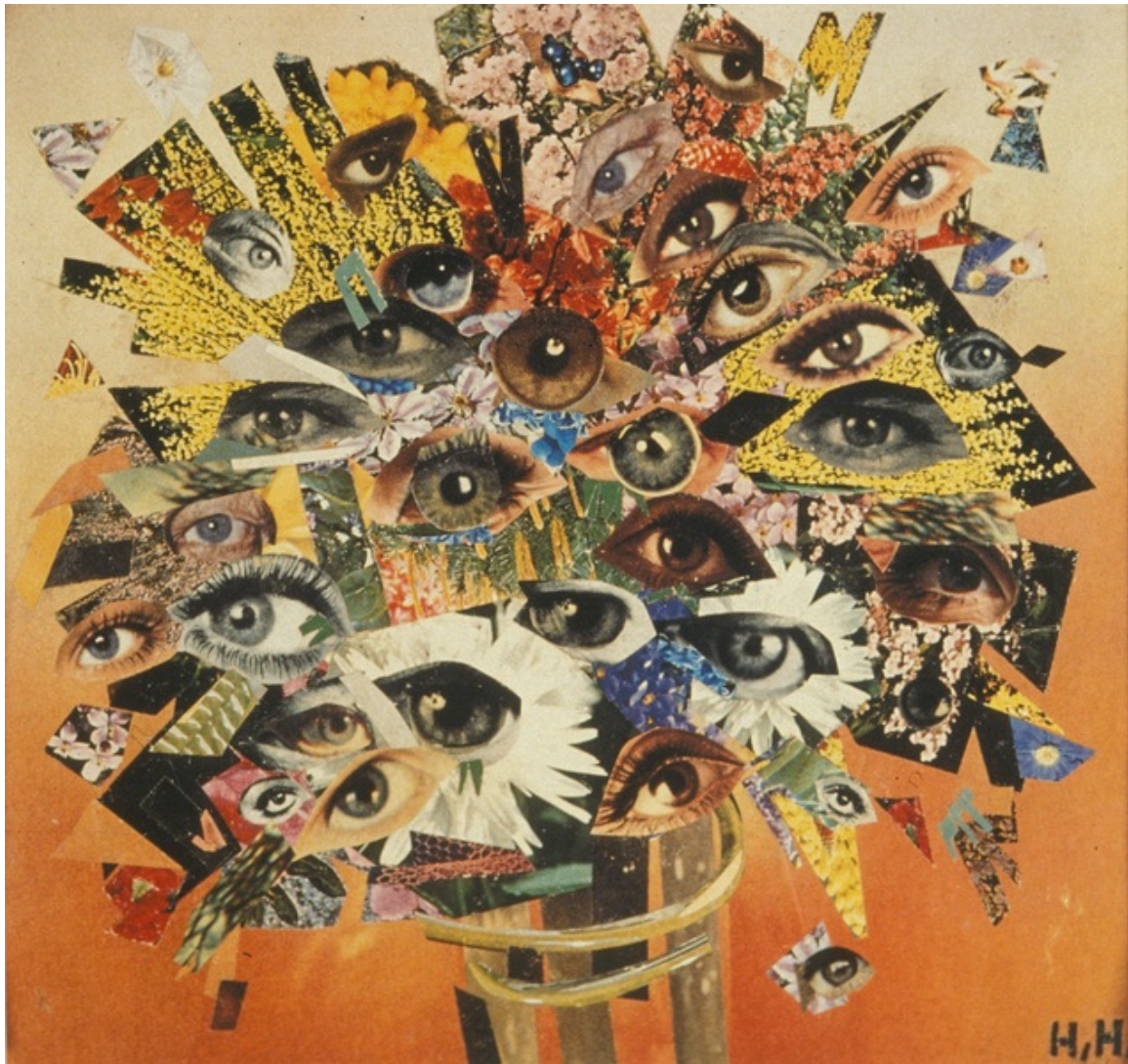
Hannah Höch Bouquet Of Eyes, 1930 Collage