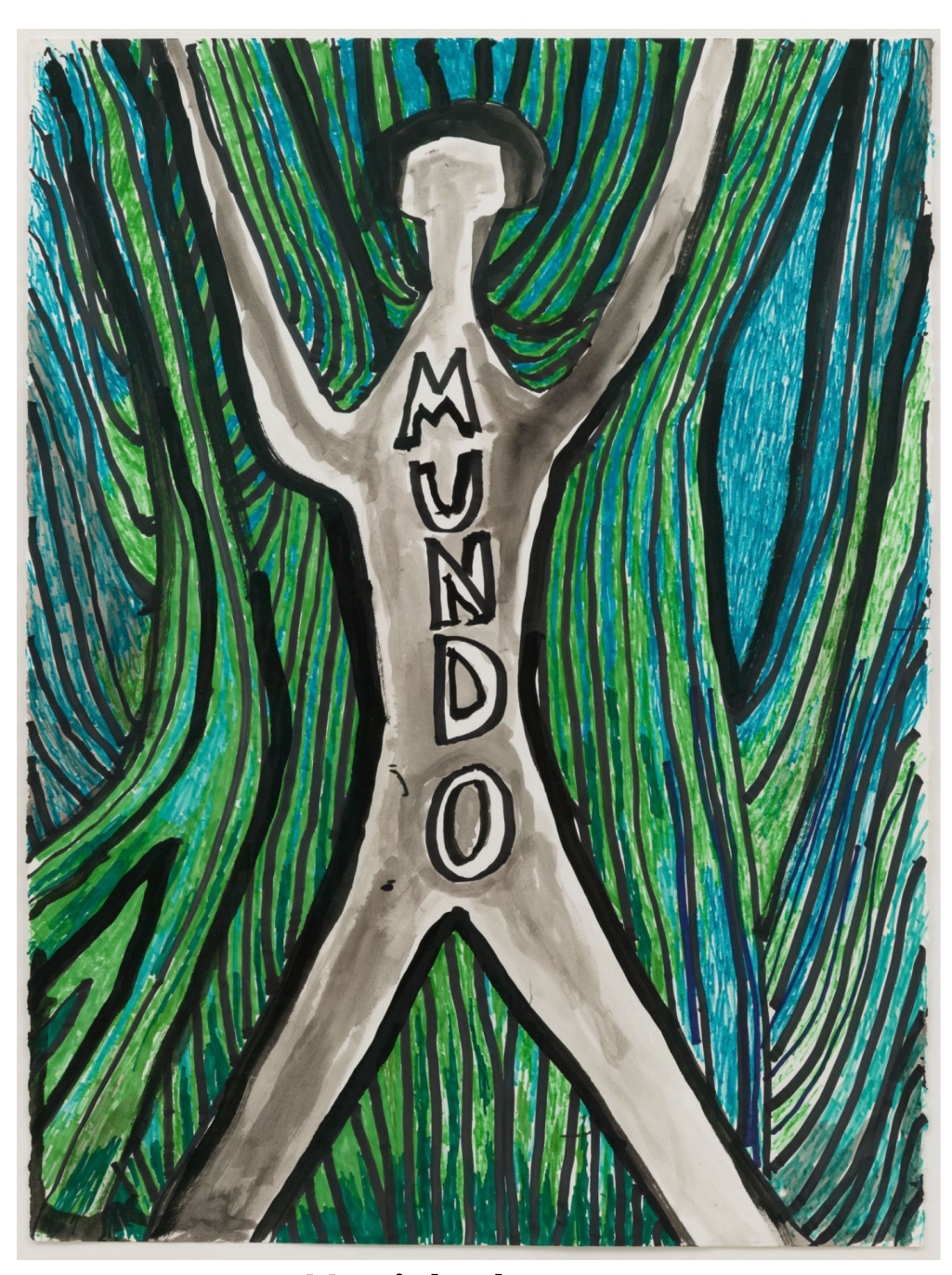
Untitled, 2019 by Luchita Hurtado