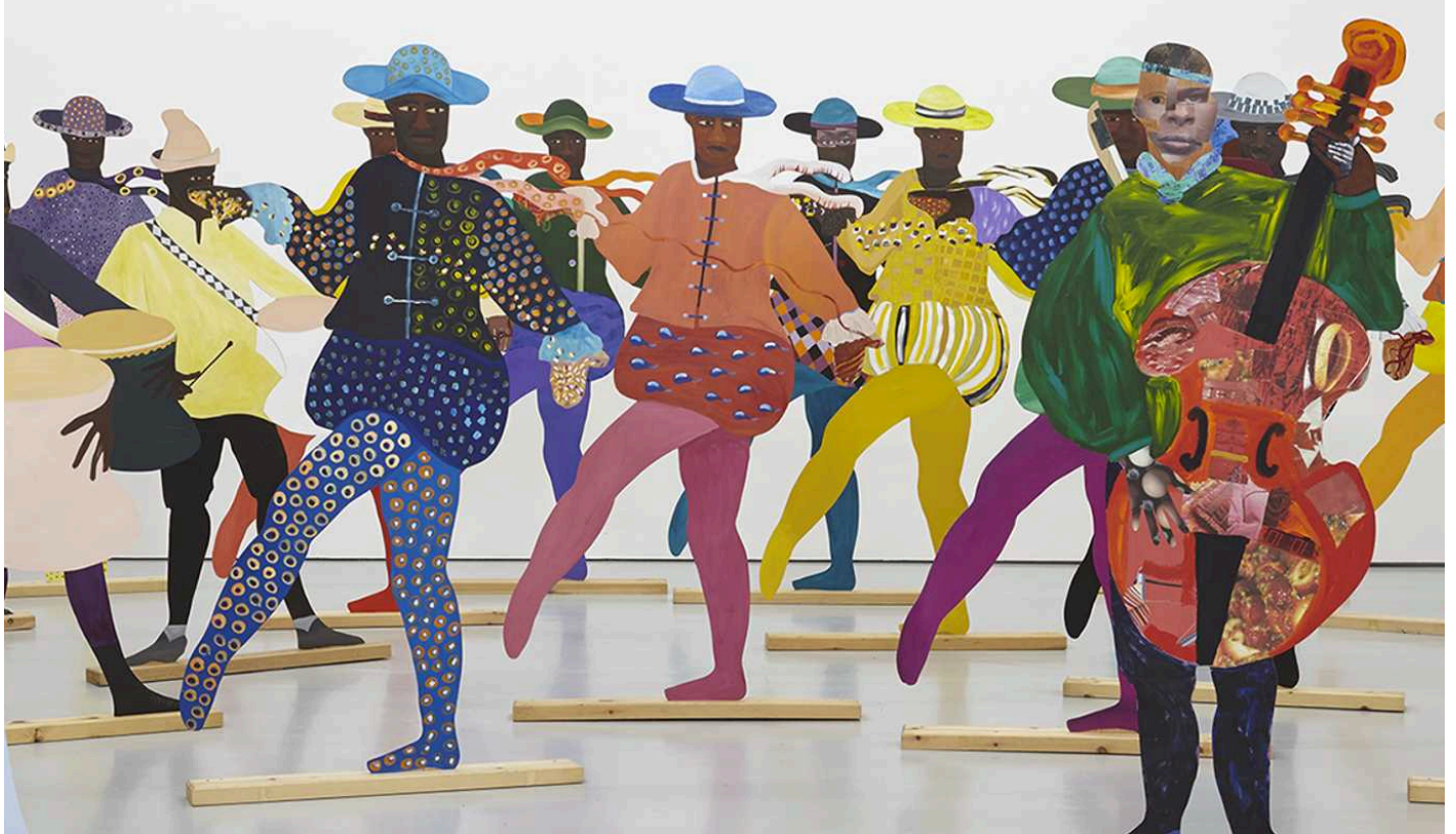
Lubaina Himid Naming the Money , 2004