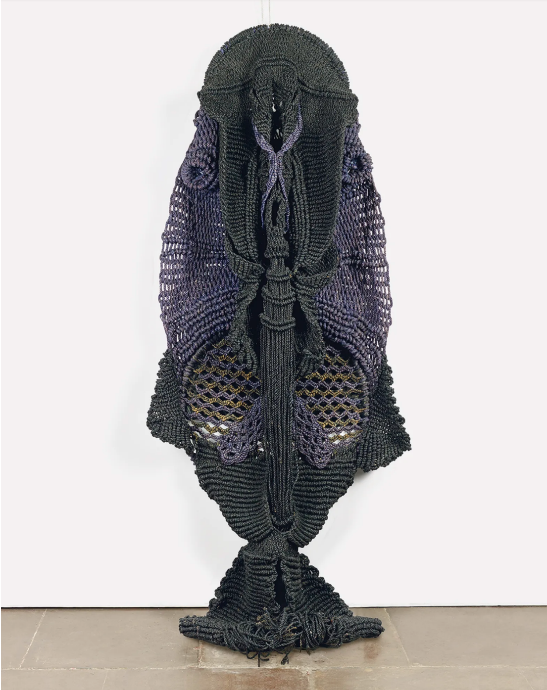
Mrinalini Mukherjee Black Devi, 1980, Dyed hemp, 101 x 34 x 9 in (257x86x23 cm)