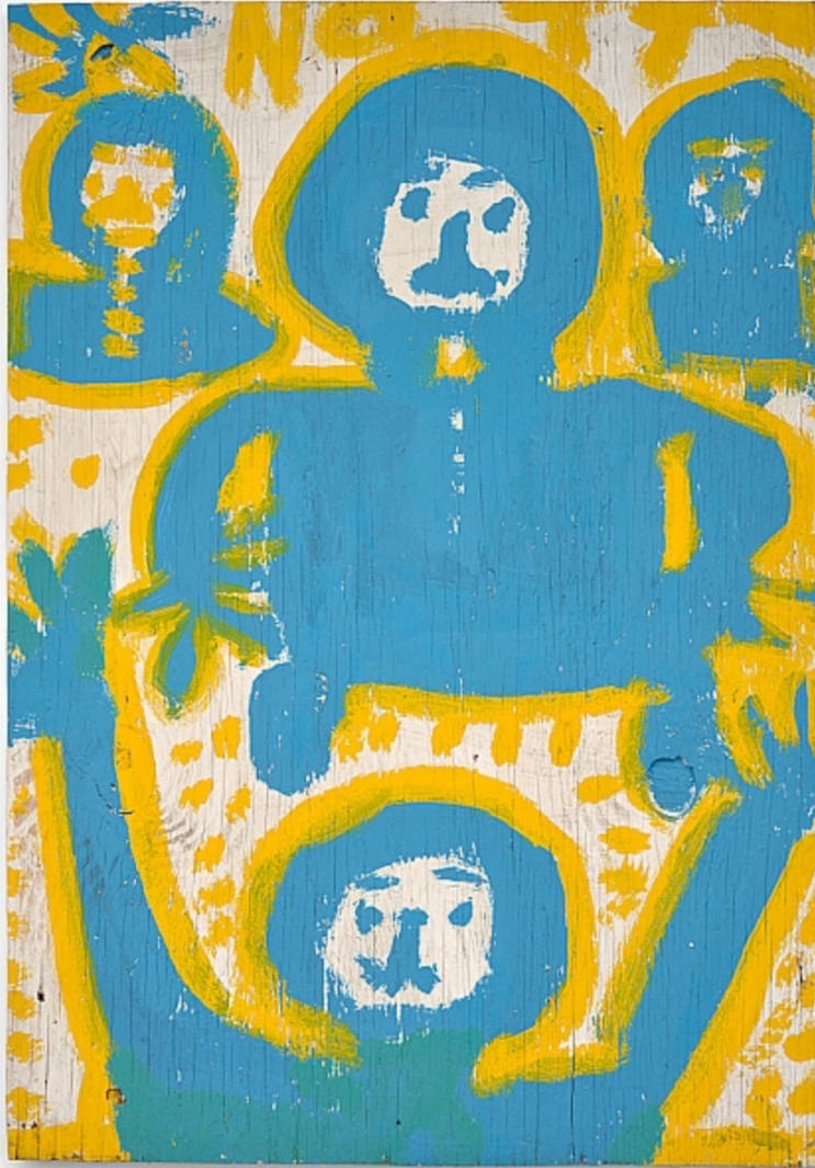
Mary Tillman Smith Untitled, 1987 Paint on wood 48 x 32 inches Collection of Souls Grown Deep Foundation