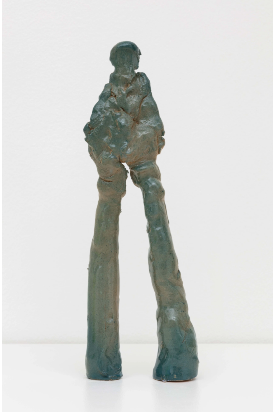
Simone Fattal Herald II , 2021 glazed stoneware 14.1 x 4.9 x 1.9 in